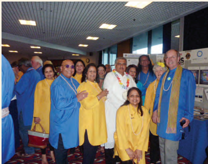
At the MD Convention

There were a number of resolutions. Multiple District subscriptions were approved for a small increase of £1.50 making the cost now £24 per annum. The Youth Fund contribution by clubs per member rise to £4 but is payable