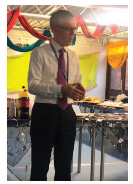
At the opening ceremony