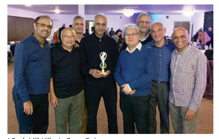
LC of Mill Hill win Zone Quiz

his was an unprecedented event where Zones E, F & G got together on 26 November for a Quiz Final. The attendance was around 75 Lion members from the 11 Clubs that took part.