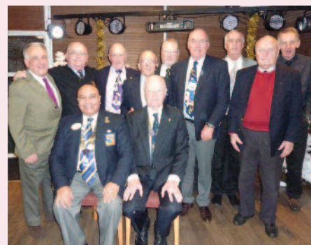
MK Stony Stratford Official visit