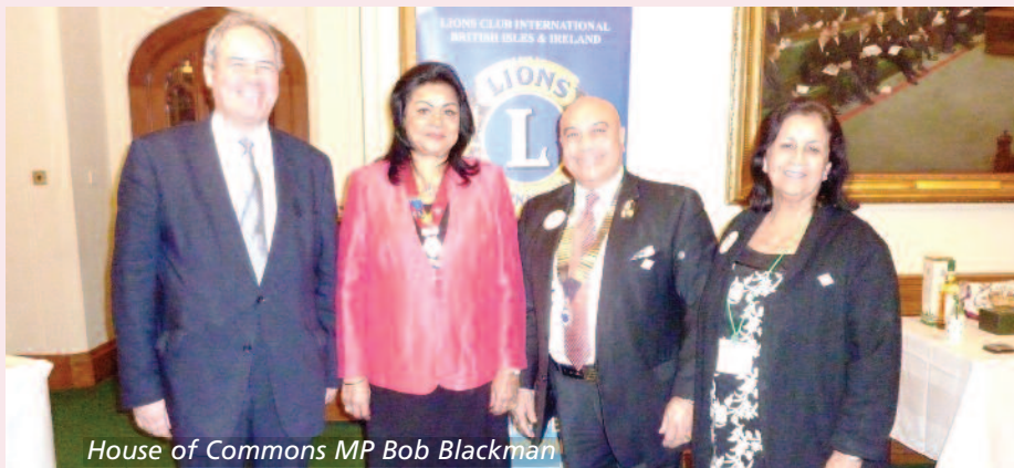
House of Commons MP Bob Blackman