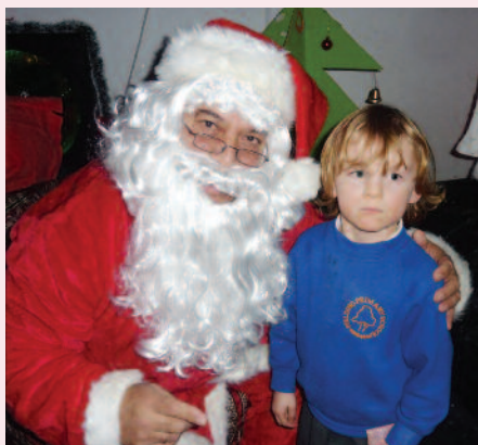
DG Santa distributing presents

In December I visited London Mill Hill, Tring, Barking, Letchworth, Fairlop, Winslow and Milton Keynes Stony Stratford Lions Clubs. While on my visits I was very pleased and impressed to see how everyone was working towards making Christmas a happy and enjoyable one for those who are less fortunate than ourselves, by distributing presents, food parcels, holding Christmas Fetes, Santa slays etc. Thank you to all.