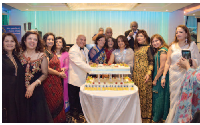
Kenton Club celebrating