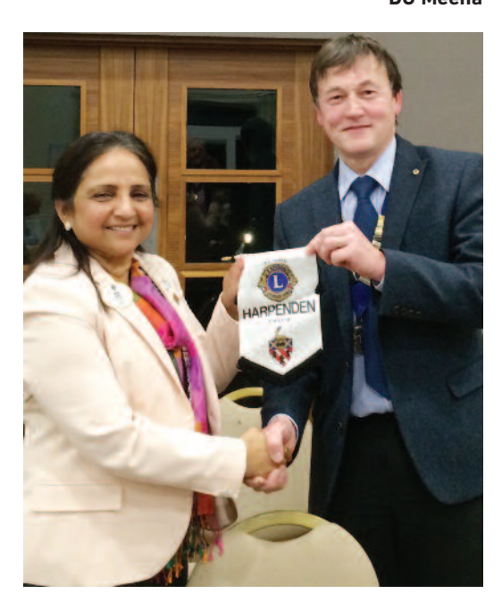
Visit to Harpenden Club