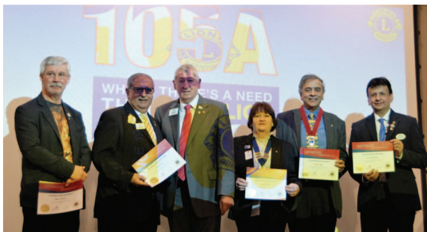
Some of the award recipients at the Convention