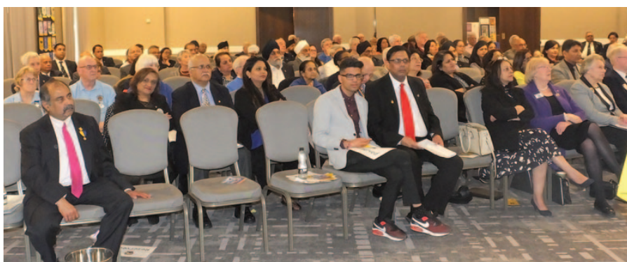
Some of the delegates