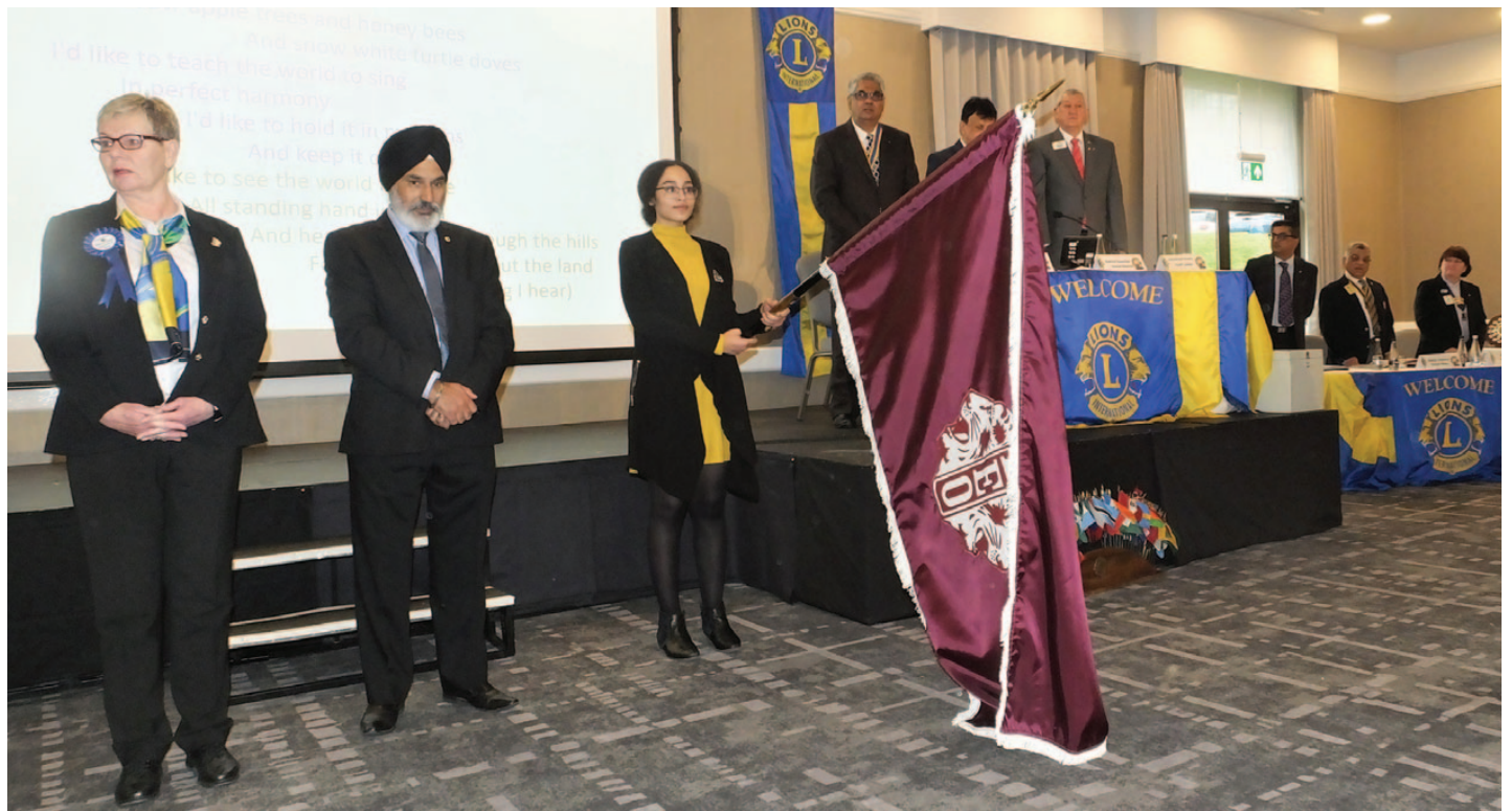
The Flag Ceremony at the Convention