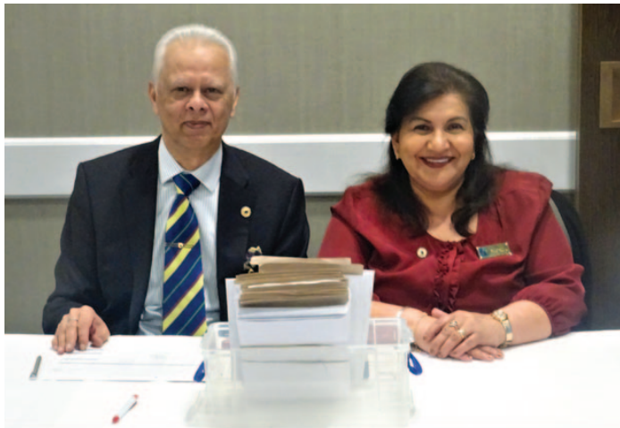
The Registration Desk