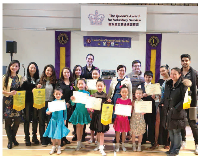
Song and Dance Charity Party

We organised a Dance and Song Charity Party to raise funds for the UK Federation of Chinese School. The singing and dancing were enjoyed by all who attended.