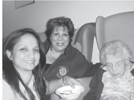
Lions Club of Osterley, brings a little festive cheer to the elderly of Heston House Nursing Home.

NB - This story was due to appear in December's edition, but due to lack of space amongst other things, it has been held back until now. We are glad it can finally appear! - Ed