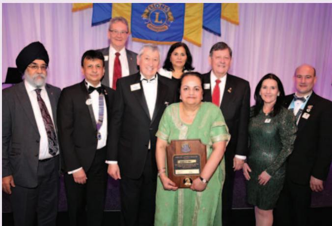
DG at the MJF Gala evening