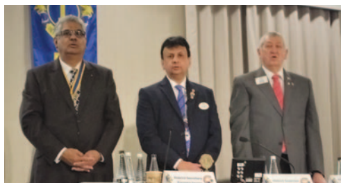
The Top Table at the Convention