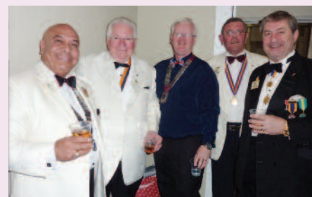
Formal evening fellowship