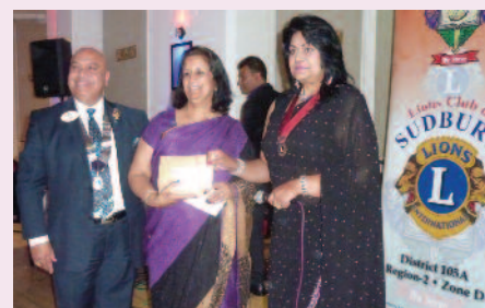
Glamour at Sudbury Lions Evening