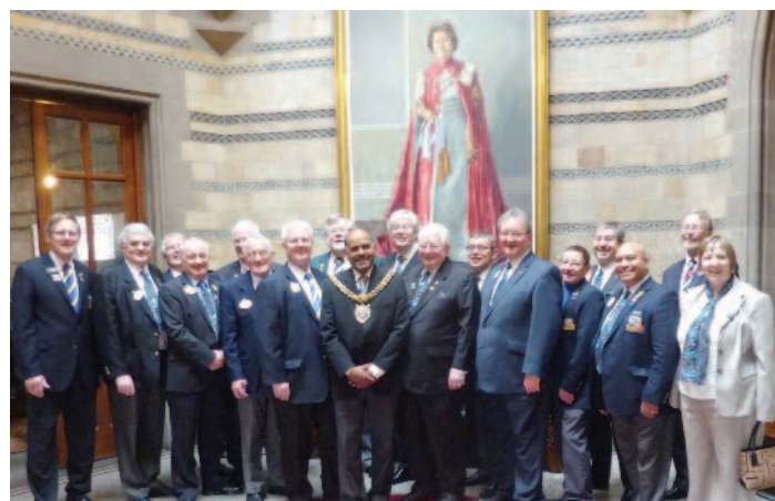
At MD Convention with Mayor of Manchester