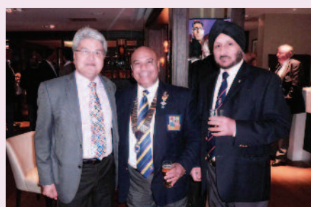
At the cabinet meeting