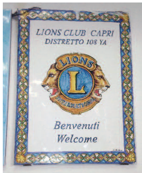
Spotted at Capri Island, Italy by Lion Shirish Sheth