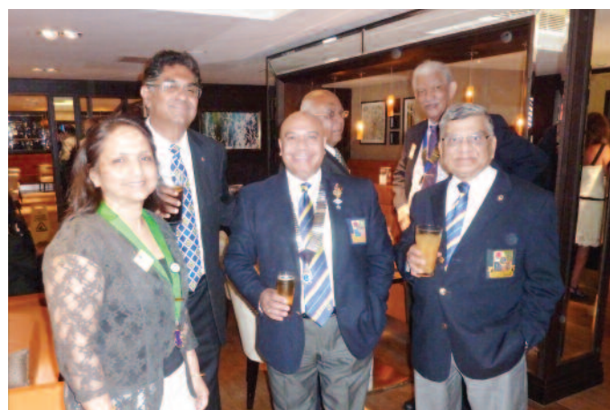
Having a pint with fellow DGs and VDG