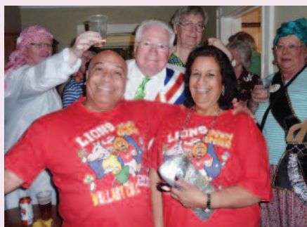
Fun evening at MD Convention