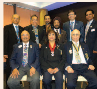
Zone D Presidents

Zone D had an excellent meeting on 22nd September.