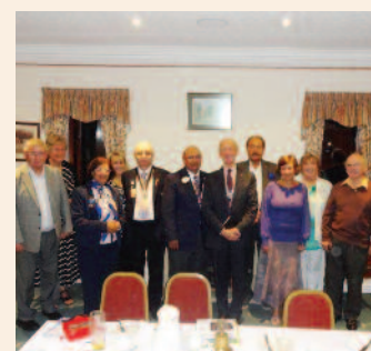
With Leighton Buzzard Lions

It was lovely meeting the Leighton Buzzard Lions on 24th September. The dinner was superb.