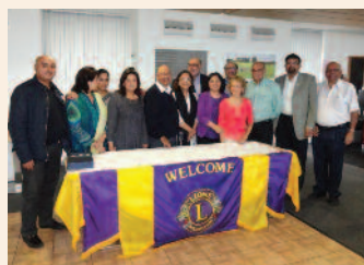
Stanmore golf day

Enjoyed golf day at Radlett Park arranged by Stanmore Lions on 14th September where they raised substantial funds for Macmillan Cancer support.