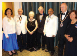
LC of Berkhamsted Charter Evening.

I thoroughly enjoyed the Charter Anniversary of Berkhamsted LC on 20th September.