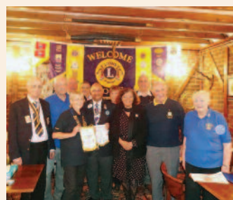
Amptill & District LC

Nice to meet the Amptill & District Lions on 15th September.