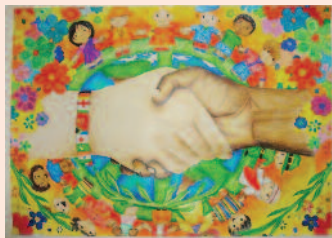
Winning entry sponsored by LC of Hemel Hempstead.