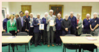
LC of Aylesbury Business meeting 5th November.