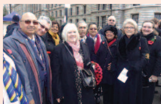
Remembrance day ceremony at the Cenotaph, Whitehall, 9th November.