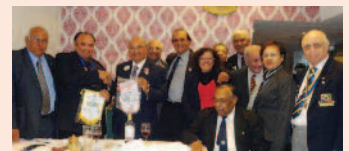
LC of Hornsey Business meeting 11th November.