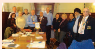
LC of Hitchin Business meeting 10th November.

Hope that you all have a good break and look forward to seeing you next year.