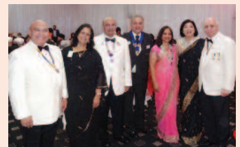
LC of Osterley 9th Charter Anniversary 14th November.