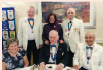
LC of Bletchley Milton Keynes 45th Charter Anniversary 25th October.