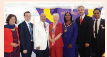
LC of Stevenage Corey's Mill 24th Charter Anniversary 16th November.