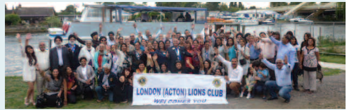
London Acton annual boat trip

On the same day of the charity walk, we then drove back to Walton on Thames to join my own club 'London Acton' on our Annual boat trip attended by most members of the club, along with family and friends. It was a very enjoyable afternoon – good weather makes all the difference.