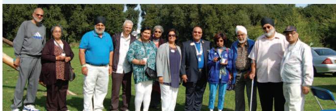
At the Fairlop Charity Walk