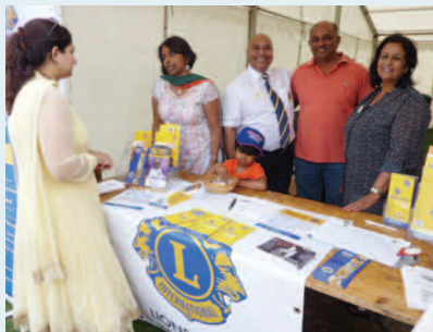
Lions Awareness Stall at the Gymkhana