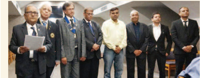
New Members Sudbury Club