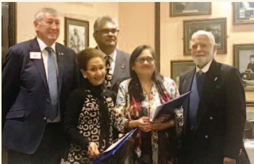
New Lions at Chipping Barnet

Welcome to our new members. I look forward to personally meeting you soon, at an event, a visit or a Charter. With a special thank you to their sponsors