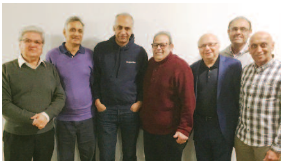
Mill Hill Lions - winners of the Zone Quiz