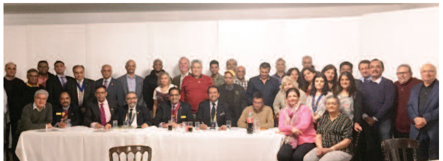
Zone E and F Quiz gathering