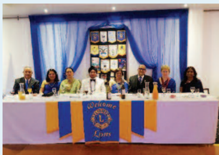
Charter Presentation at Hatch End Club

LC of Hatch End, formed on 7th October had their Charter presentation on 4th February 2017. A very well organised and enjoyable event with almost 30 Lions Clubs present that