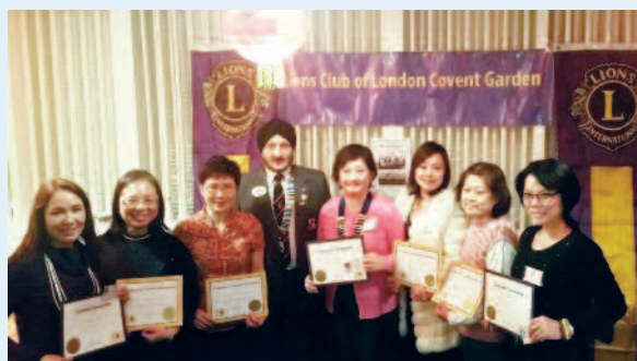
New members at Covent garden Club