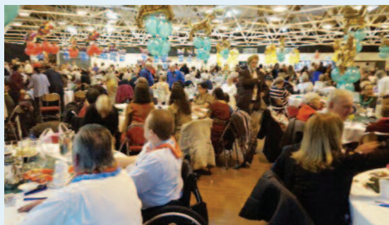
Senior Citizens Celebration at Harrow Leisure Centre on 26 Feb 2017

I had the opportunity to attend the Multiple District Lioness conference in Hutingdon on 18th February 2017. A lot of business was conducted and presentations were given by some very interesting speakers.