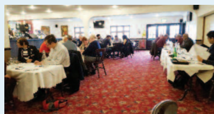
District Quiz Finals