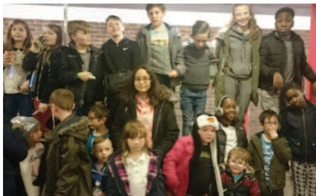
Children were treated to the Rapunzel Pantomime.