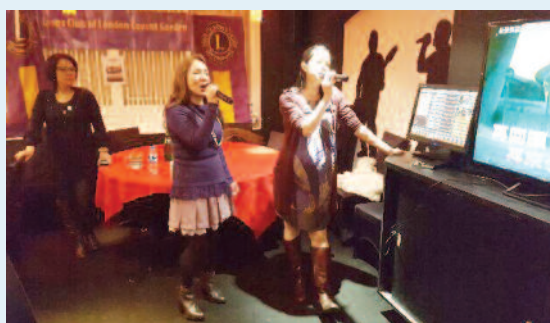
Enjoying Karaoke after the business meeting at LC of Covent Garden

Lions of District 105A convey their condolences to the families.