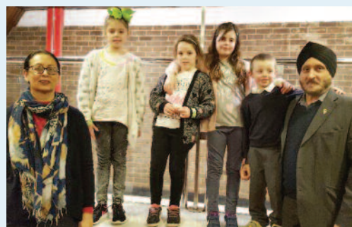
Pantomime for disadvantaged children organised by Leo's of Fairlop