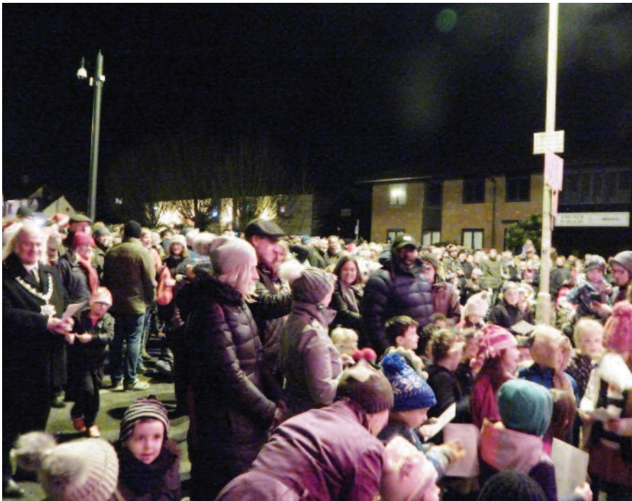
Singing Christmas carols in Tring.