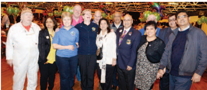
The Senior Citizens Celebrations committee