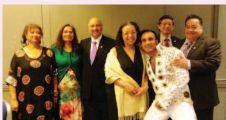
LC of London Central 'Elvis Presley' music evening 31 January