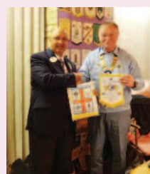
LC of Carterton 3 February