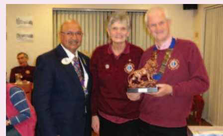
LC of High Wycombe 10 February