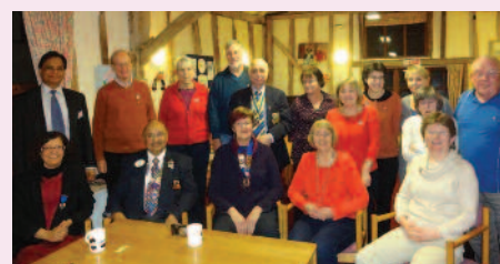
LC of Royston - 28 January