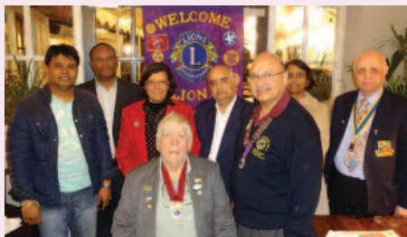
Zone C - 26 January