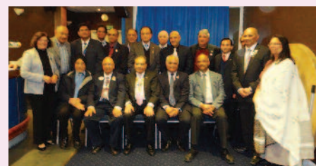
LC of Chipping Barnet visit 11 February