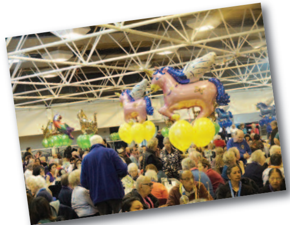
A glimpse of Senior Citizen's celebrations – see inside for more