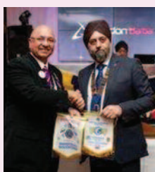
LC of Wantage & Grove. New member was inducted at Music evening.