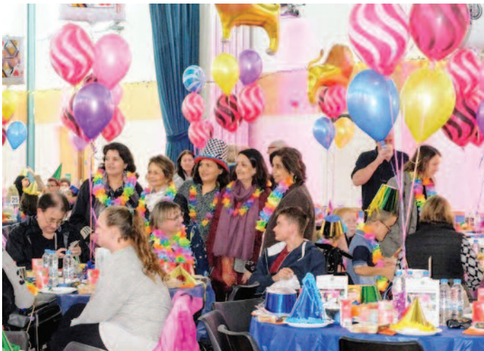
District Youth Celebration party scene

Ealing, Edgware, Enfield, Fairlop, Feltham & Whitton, Harrow & Pinner, Hatch End Centennial, Hayes & Harlington, Hemel Hempstead, Kenton, Letchworth & Baldock, London Acton, London Belmont, London Covent Garden, London Golders Green, London Hendon, London Kingsbury, London Mill Hill, London Seven Kings, Luton, MK Stony Stratford, Northwood, Redbridge Centennial, Royston, Ruislip, St Albans, Stanmore, Stevenage Corey's Mill, Sudbury, Thame, Tring, Wanstead & Woodford, Watford and Wembley .