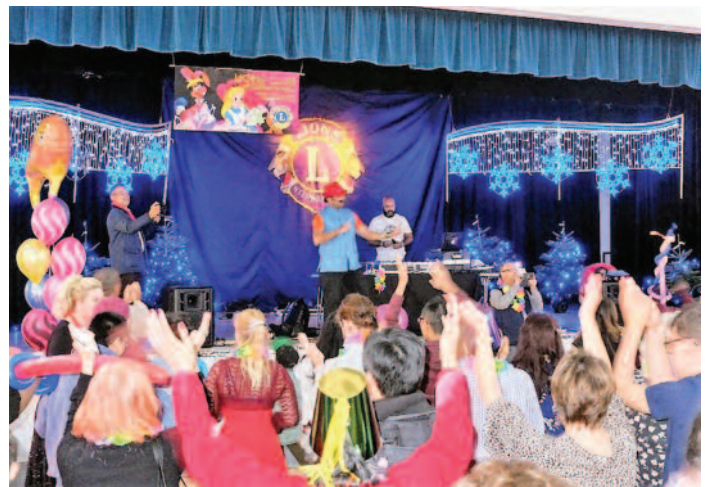
Everyone enjoying the party

We would like to thank the following clubs for supporting the District Youth Celebration 2018 by helping, sponsoring and booking tables. Lions Clubs of: Amptill District, Aylesbury, Biggleswade Sandy, Bletchley Milton Keynes, Chipping Barnet,