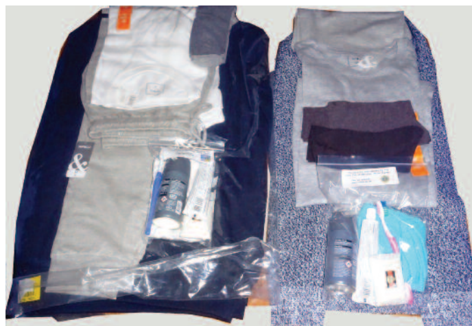
Clothes donated by the Lions Club of Bletchley