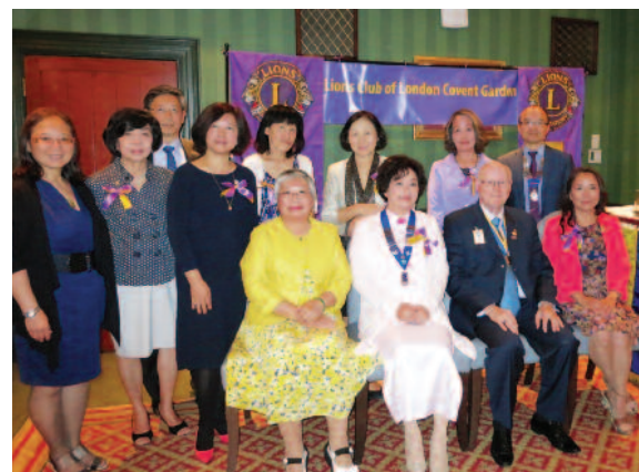
Handover at LC Covent Garden