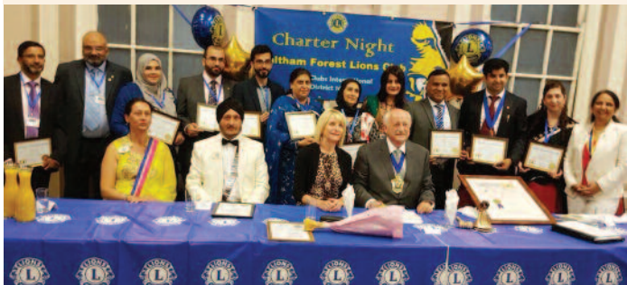
At the Waltham Forest Charter Night