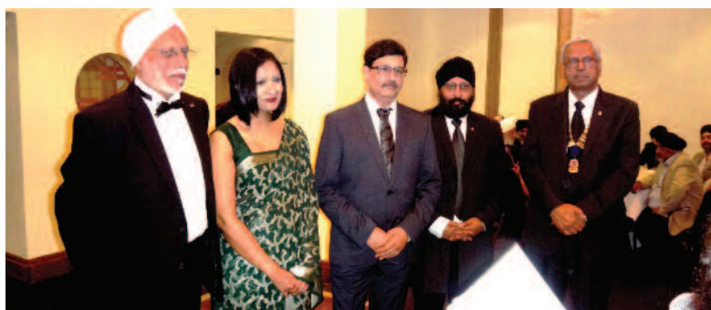
Inducting new Lions at LC of Wanstead and Woodford