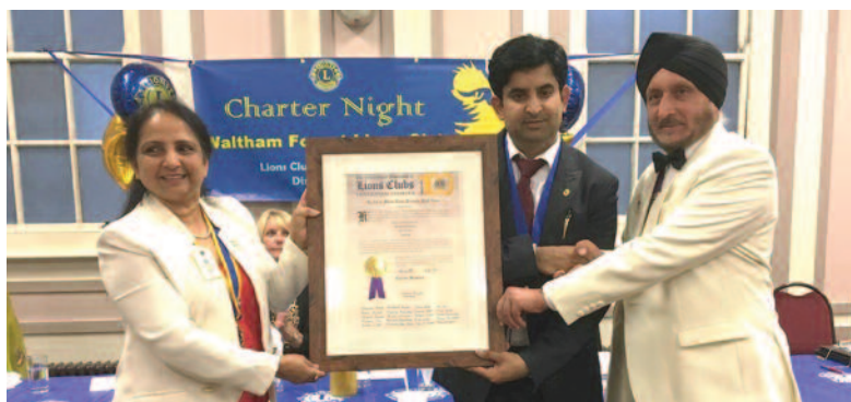
Charter night at Waltham Forest Club