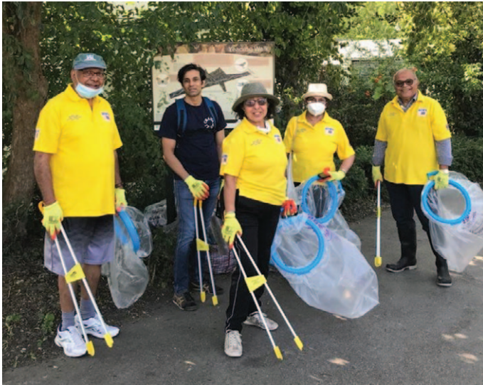
Litter Pick at North Harrow