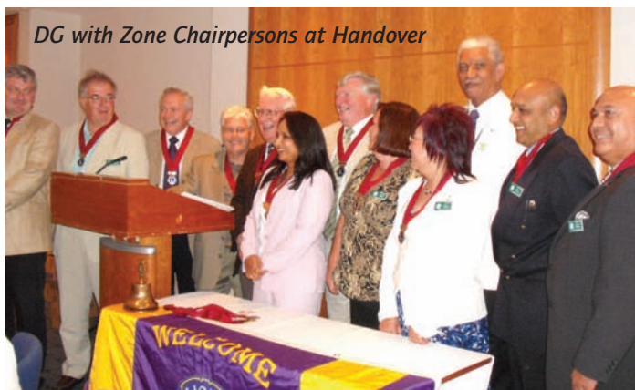
DG with Zone Chairpersons at Handover