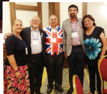
With 105A Lions