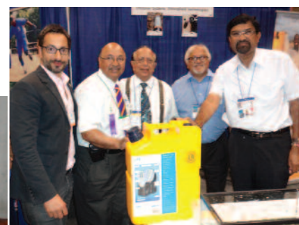
105A Lions with Jerrycan project