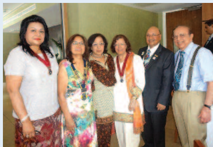
Charter and Handover of London Central Club

It was an interesting experience to attend LC of Harpenden Highland Gathering event on Sunday 13th July and also the Church Street party of LC of Feltham & Whitton. I was proud to be received by my own club, LC of Edgware at the first Business meeting, in my official white jacket.