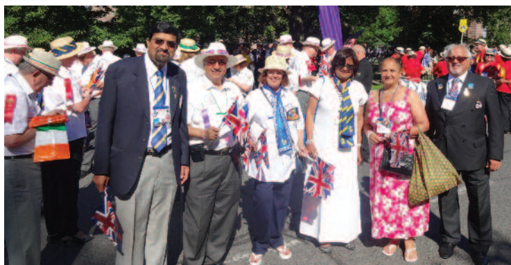
Before the parade