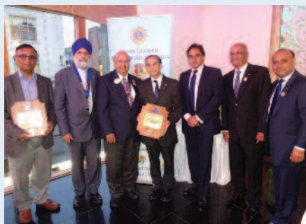
MJF awards at Seven Kings

After returning from Toronto I conducted the handover of LC of London Seven Kings. Two Seven Kings members were presented with MJF awards. Congratulations to both the Lions. I have also been attending Zone E and Zone F social meetings as well as Zone E fun day.