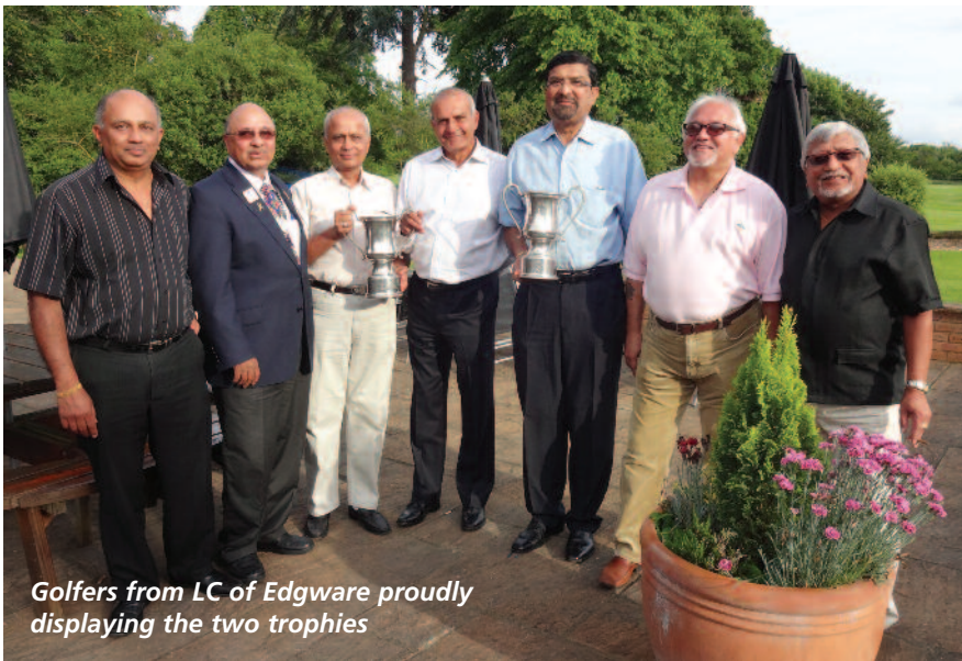
Golfers from LC of Edgware proudly displaying the two trophies