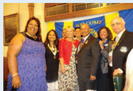
Charter Night at Palace of Westminster Club