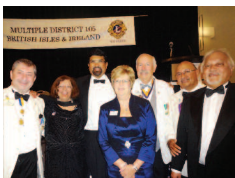
MD 105 Lions at evening reception