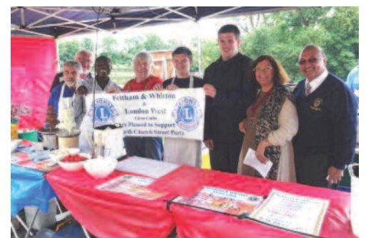
Feltham street party

The event finished with a live band in the evening (Midnight).