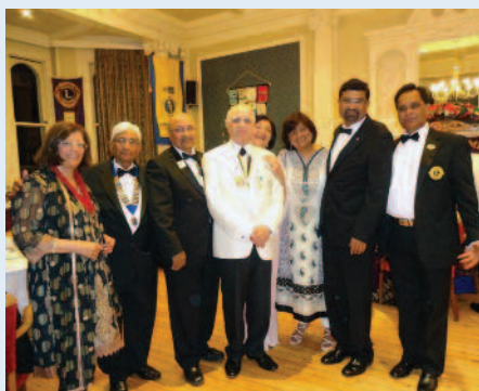
Handover at LC of Finchley