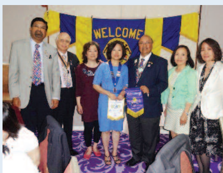
Handover at Covent Garden Club

Before going to Toronto I attended and managed the District 105A Golf day on 11th June, held at Richings Park Golf Club. Both the Ram Jaggi and Elliot Shubert trophies were won by LC of Edgware!! I had the pleasure of conducting the handover ceremonies of Lions Clubs of Edgware, Finchley and Ealing. I was also the honoured guest at Charter ceremonies of Lions Clubs of Finchley and Covent Garden. It was a great privilege to be the chief guest of the combined handover/charter ceremonies of Lions Clubs of London Central and Kenton.