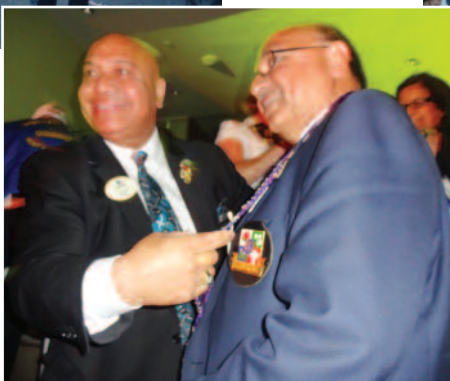
Pulling the blue ribbon