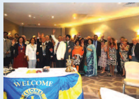
At the District handover