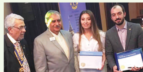
Induction at London Central Host

Welcome to our new members, I look forward to personally meeting you soon, at an event, a visit or a Charter.