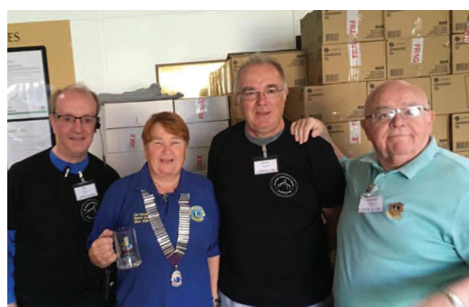
DG with an empty pint!

This year the 2019 Festival is taking place between 25 and 28 September. St. Albans Lions are 'running' the glasses stand and we need as