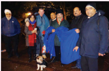
Distribution to homeless in Holborn 11 December

I had opportunity together with few Lion members to distribute some to the homeless in Holborn.