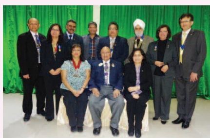
Zone D meeting - 4 December