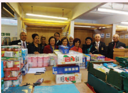
DENS food bank

I was happy to accompany LC of Belmont members to deliver food parcels to DENS food bank in Hemel Hempstead. Also had opportunity to see DENS charity shop, Furniture Warehouse and Night Shelter for the homeless.