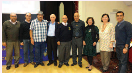
LC of London Hendon - Race Night 23 November