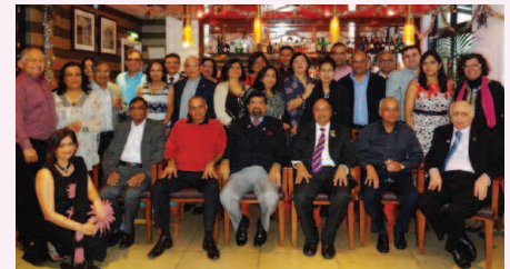
LC of Edgware Christmas Lunch - 7 December