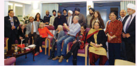
Senior Citizen party by LC of Ealing. 6 December