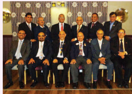
LC of Mill Hill meeting - 1 December