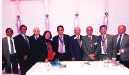
Zone E Meeting 20 November