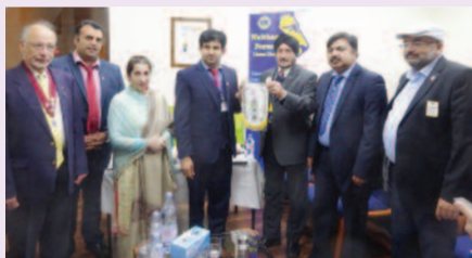
DG with LC of Waltham Forest

My visits have included LC of Hitchin, Enfield, Seven Kings, Waltham Forrest, Zone G, Zone M&N and Zone B, where I have had the privilege of presenting the service Chevrons and Centennial Service Challenge patches.