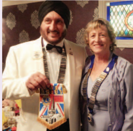
Charter Celebrations full of unusual fun at LC of Hemel Hempstead

My visits have included LC of Hitchin, Enfield, Seven Kings, Waltham Forrest, Zone G, Zone M&N and Zone B, where I have had the privilege of presenting the service Chevrons and Centennial Service Challenge patches.