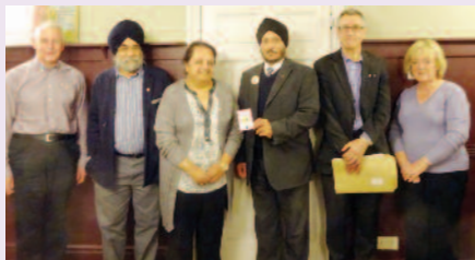
DG with LC of Hitchin

One of my main aim as a DG was to work tirelessly on the issues effecting retention of members. To that end, I am concentrating on visiting smaller clubs (less than 10 members) where Lions have spent time brainstorming on membership issues. I am very excited at the positive ideas that have come out of the open discussions resulting in action plans being put in place.