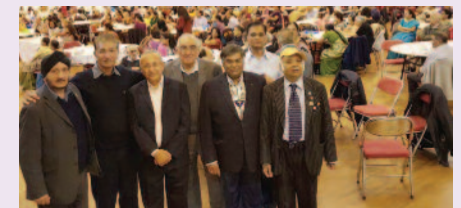
LC of London Golders Green sponsoring food and entertaining senior citizens for Diwali at the Harrow Leisure Centre