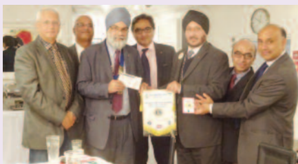
DG with LC of Seven Kings

Every club should receive over the next few days, consultation papers on redistricting of our MD. I urge all the Lion members to discuss these proposals in your clubs and Zones. At the end of the