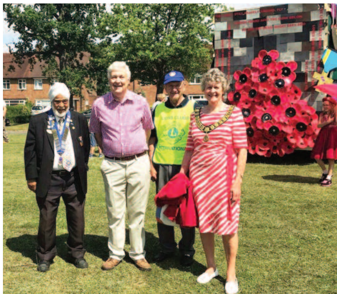
At the Carnival

Every year Watford Lions Club organises the Abbots Langley Carnival, come rain or shine and with good fortune it is always successful. This year, with some new members in tow, it was even better.