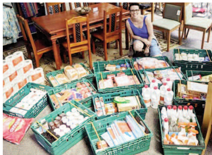
Bedfordshire Food Aid Network is run by volunteers from the Preen Reuse Centre