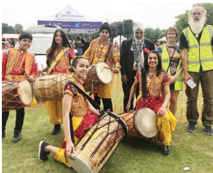
Carnival Dhol Players