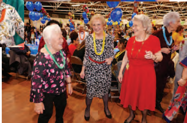
Images from Senior Citizen's Celebration 2019