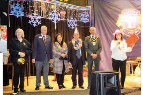
Images from District Youth Celebration 2019