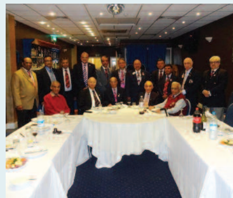
Members of Lions Club of Enfield