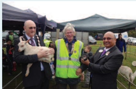
Fun at Berkhamsted fête