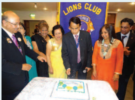
LC of Belmont Eid celebration

Since the last newsletter I attended LC of Belmont for the Eid Celebration party raising funds for children in Palestine.