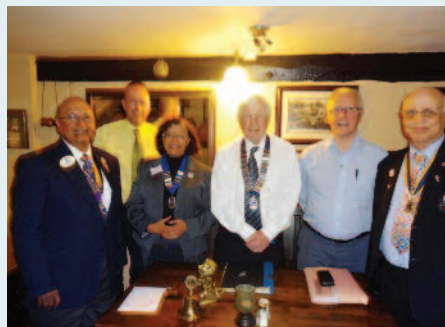
St. Albans Lions

On 1.9.14 visited the LC of St.Albans. I hope to go their Beer festival end of the month!