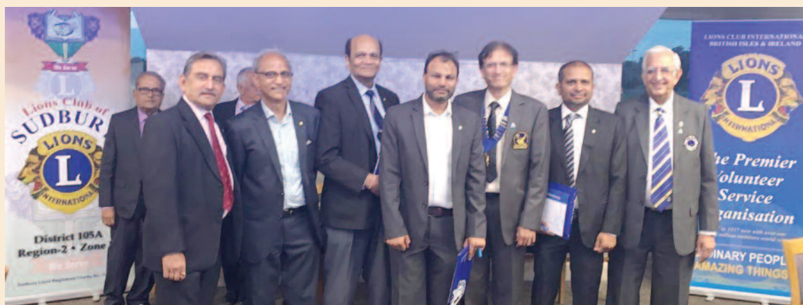
◀ New Lions at Sudbury Induction