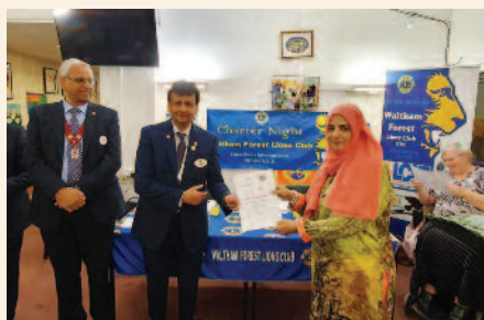
At Waltham Forest Charter Night