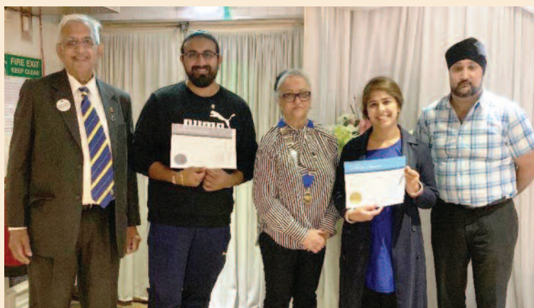
▲ New Young Lions at Southall Club