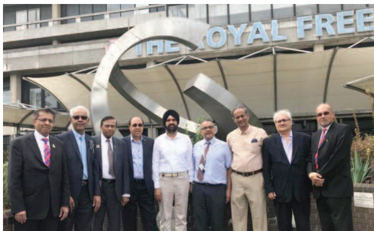
Enfield Lions visiting the hospital