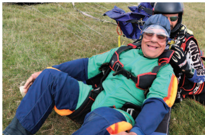
Lion Angelo safely on ground