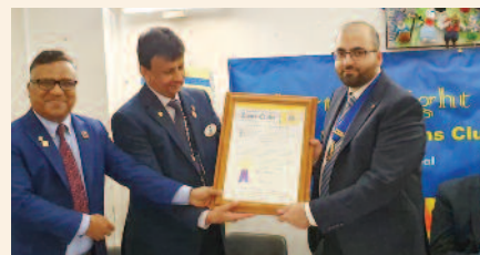
Presentation at Waltham Forest Club

you that your District Officers are here to Serve You, if and when you need it. There is still much yet to be accomplished by all of us. Please continue to invite the DG Team to Club meetings, Zone meetings and your celebration Charters but don't forget we are Lions and equally would love to help at your service activities