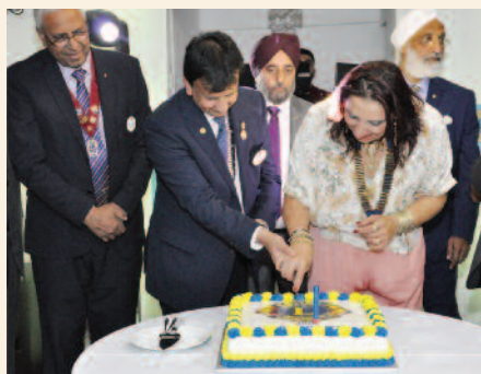
Cake cutting at Wanstead and Woodford 40th Anniversary

Clubs are asked to do something to help the blind or visually impaired, or to raise awareness of vision issues in their area. Many Clubs collect used spectacles sending them to the Third World via Chichester Lions. Do you have a group or organisation which supports the blind and visually impaired in your community? If not do something for them during October or help a blind person living in your area.