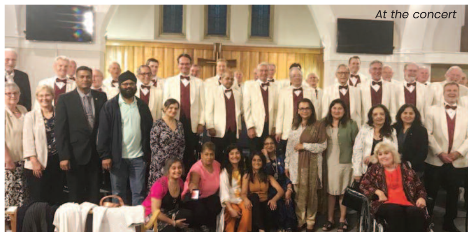
At the concert