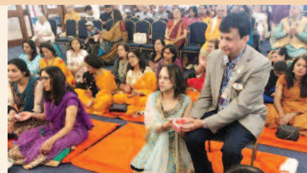
Fundraising event at Kingsbury Club

Everyone has been very busy serving their communities but I want to remind