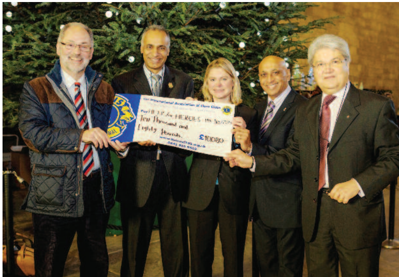
Presentation to Help for Heroes at the Houses of Parliament