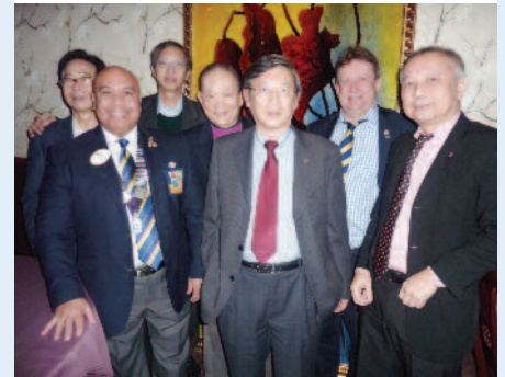
DG at Chinatown

Our District Project – 14th Senior Citizens Celebration, held on the 2nd February was a wonderful day for so many Senior Citizens and for some this is their annual treat. All round there were smiling faces and many were taking part in the dance sequences.