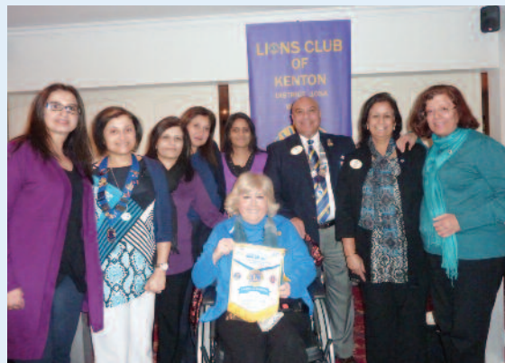
DG visit to Kenton Club

The end of January sees one of the last Council of Governor meetings of the year. It was held in Solihull on the 24-26 January.