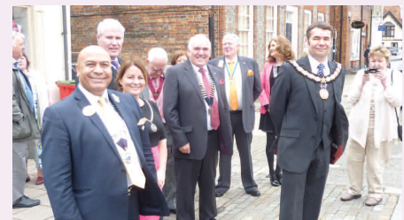
Mayor, DG and members Thame LC