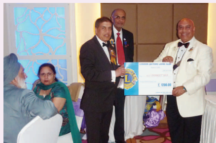
London Acton Charter

After the Convention was over, we headed back to London to attend the 37th Charter of my own club London Acton. We returned at 7.40pm and we were then whisked away by our son to the venue.