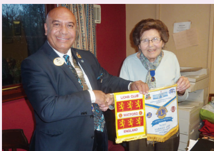
Official Visit Watford

Welcome to the May issue of my Newsletter. I have less than two months left of my Lionistic year as your DG. In this month I have been busy visiting clubs and also attending club charters. On my official visit to Wormholt and White City Lions Club (formerly London White City), I had the pleasure of inducting three new members.