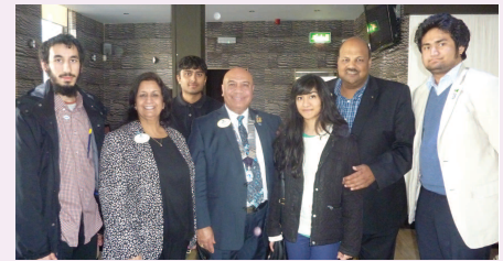
Leo Awareness Lunch

MD Convention in Manchester is fast approaching on 9th -11th May. If you have not booked yet please do so. This is a fantastic opportunity to meet members