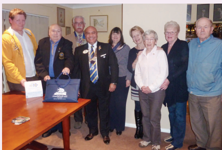
Official Visit Staines & Ashford