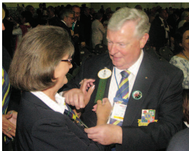
Detaching the ribbon... now I am the DG!