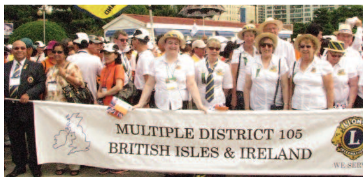
MD delegates ready for the parade