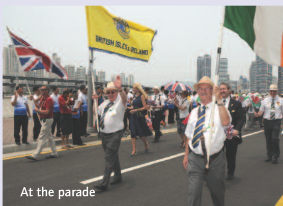
At the parade