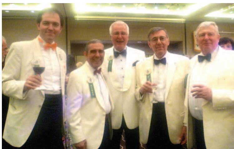
DG Elects enjoying fellowship