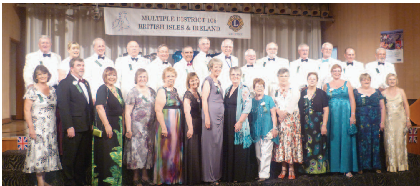
MD Governors with spouses