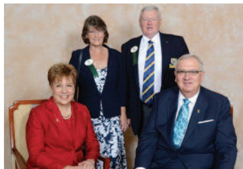
DG with International President