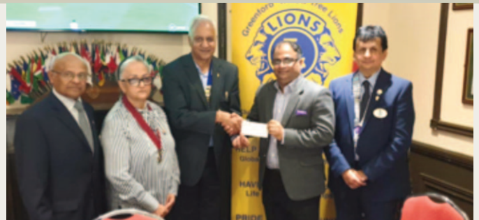
At Greenford Willow Club