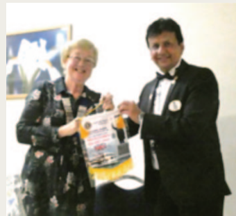
DG at Biggelswade Sandy's 41st Charter Celebrations

Please visit the LCI website for updates. I want to remind you that your District Officers are here to Serve You , when you need it. There is yet much to be accomplished by all of us. Please continue to invite the DG Team to Club meetings, Zone meetings and your Charter celebration but don't forget we are Lions and equally would love to help at your service activities.