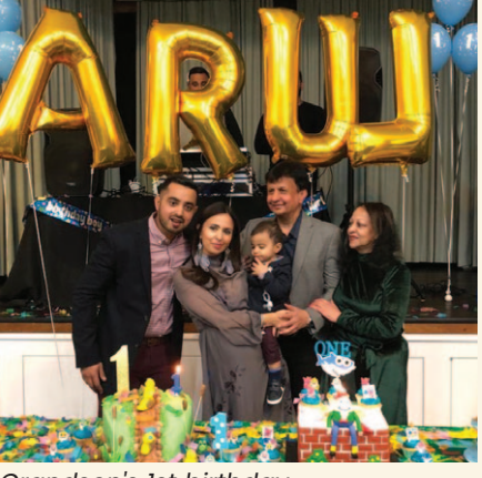
Grandson's 1st birthday