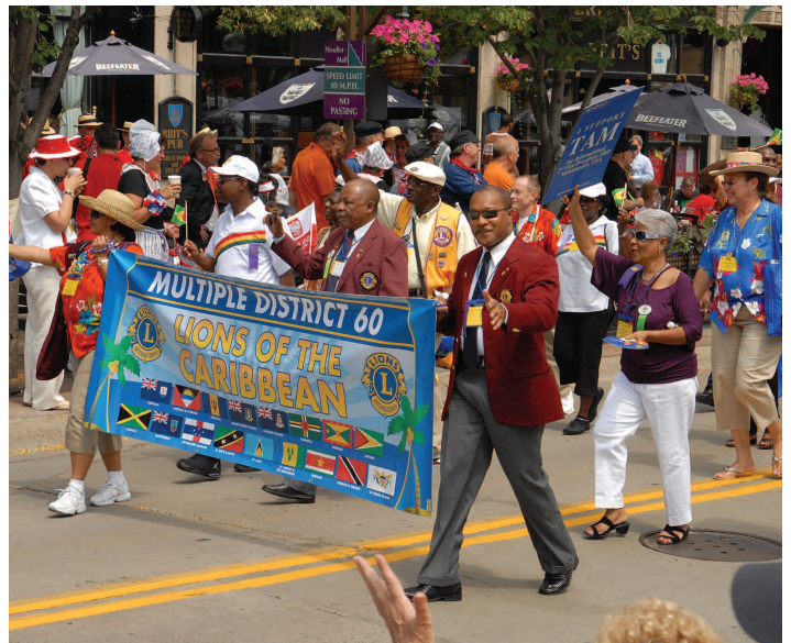
Lions of the Caribbean