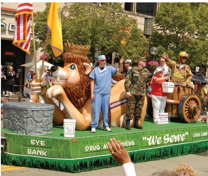
Lions float at the Convention