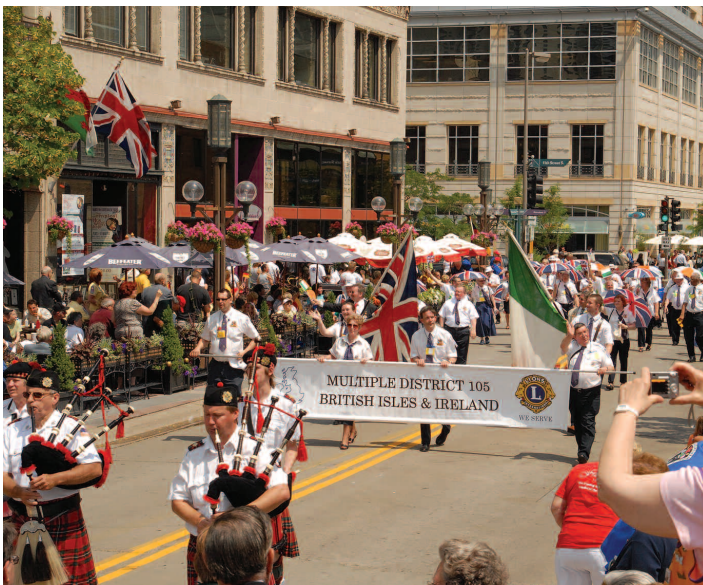
MD 105 Lions with bagpipe band