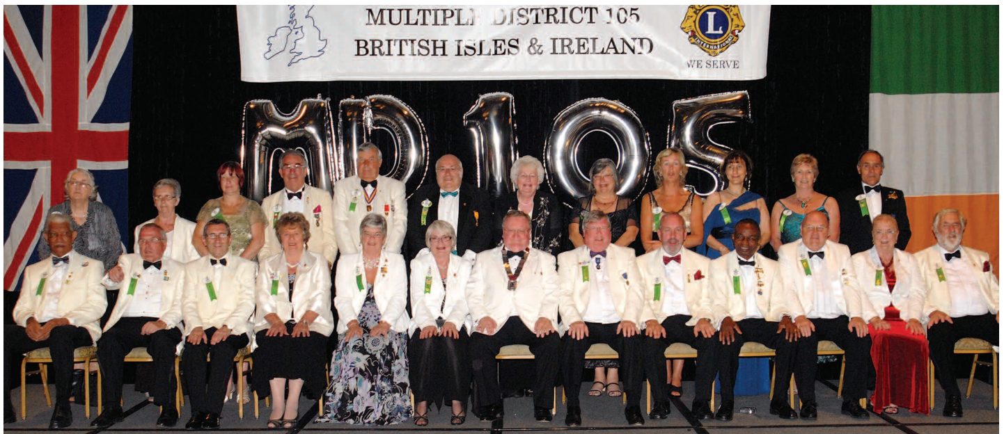
DG Elects of MD 105 at the convention