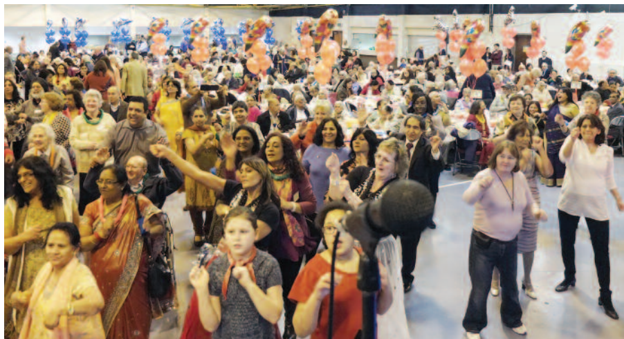
14th. Annual Senior Citizens Celebrations Sun 2nd. Feb 2014