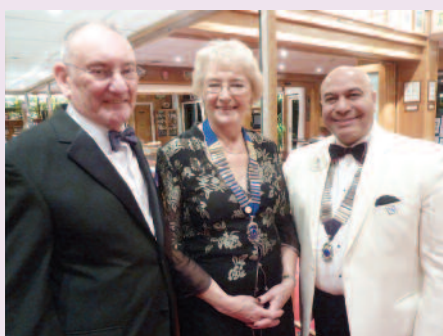
Ruislip Charter Night