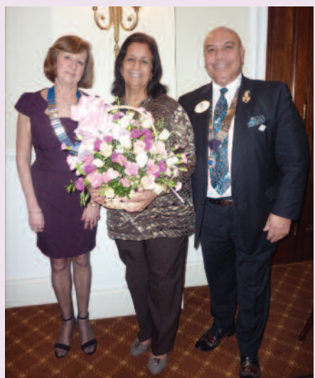
Flowers at Leighton Buzzard Charter

My clubs visits are still continuing. Zone C swimming gala, held on the 9th February, was a fantastic day –swimmers with disabilities swam their way to Medals. Thank you and well