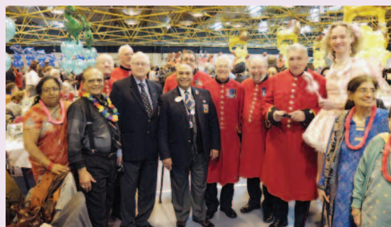
Happy faces at SCC 2014