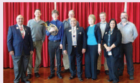
At the Music Competition